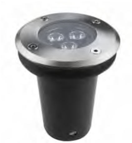
PX-0128-INO ● 3000°k 370 lm PX-0123-INO ● 4000°k 420 lm

Acero inoxidable Stainless steel Acier inoxydable