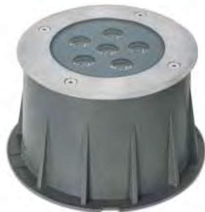
PX-0355-INO ● 3000°k

Protection contre les intempéries maximale grâce à la silicone.